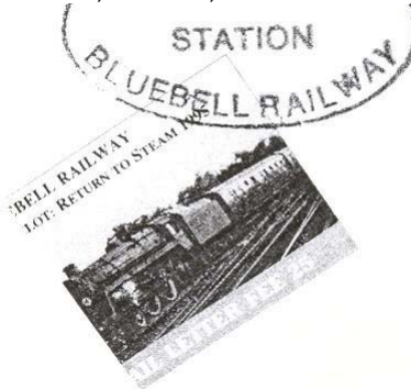
7 Sheffield Green; Sussex, UK