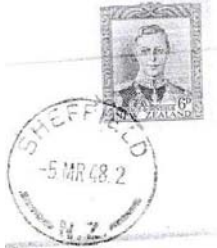
3 New Zealand