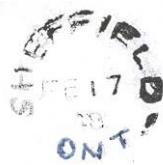
4 Ontario, Canada