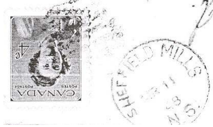
5 Nova Scotia, Canada